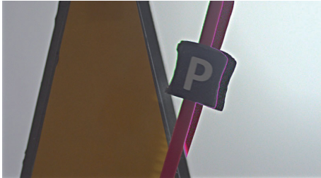
Multiple exposure HDR

Condition: Exposure time (3.2 ms/0.2 ms) blended image