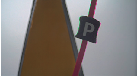
Quad Bayer Coding HDR